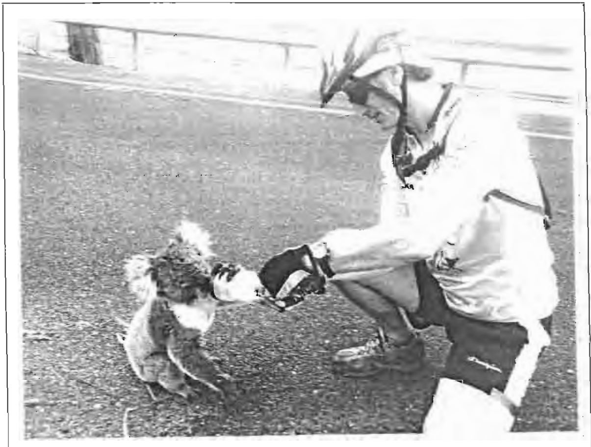
Photo: Koala deprived of its own healthy habitat

EXAMPLE: Lord Jesus, thank you for your perfect love for us. Forgive us for the things we have knowingly done that harm your Creation and for those things we have unknowingly done. We confess that we have been self-centred and seek your forgiveness and renewal of heart, through your death on the Cross for our sins. Lord God, the task of caring for your good Creation is great but we are encouraged by Jesus' words, spoken of the woman that anointed his feet, "She has done what she could." In Jesus' holy Name we pray. Amen.